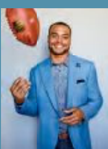
On the cover Dak Prescott photographed exclusively for American Way in Dallas