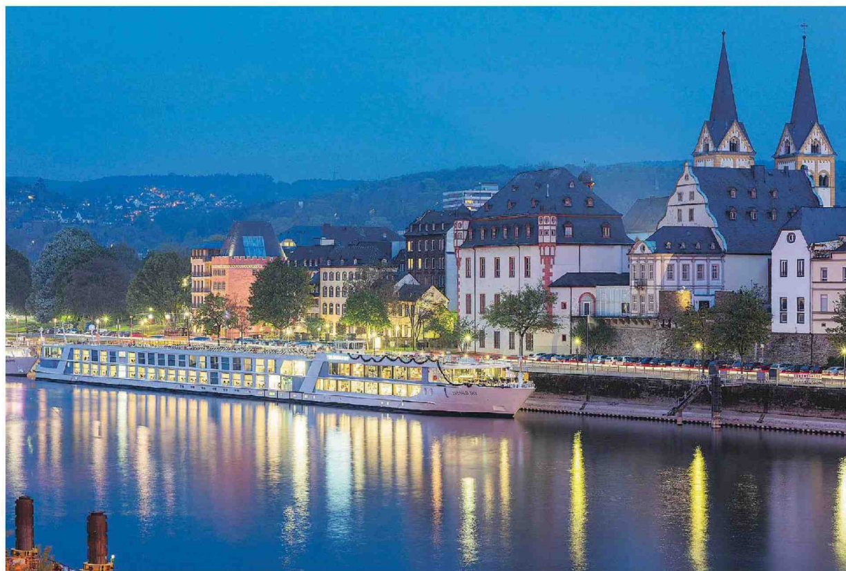
Emerald Waterways is launching three new ships that will cruise down the unforgettable rivers of Europe this year. EMERALD WATERWAYS