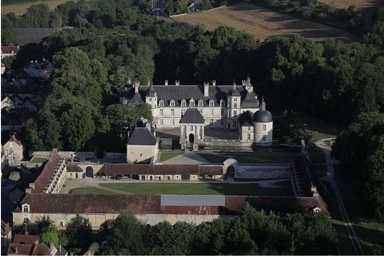
Few places impress like France

What did you do for your 35th birthday? Imagine sipping a lovely glass of Bordeaux while actually in the famed wine region of France. Sounds pretty great, right? Well, for the past 35 years, French Country Waterways has offered that experience and more on their river cruise tours of France on their sleek and stylish barges designed specifically for the waterways they navigate.