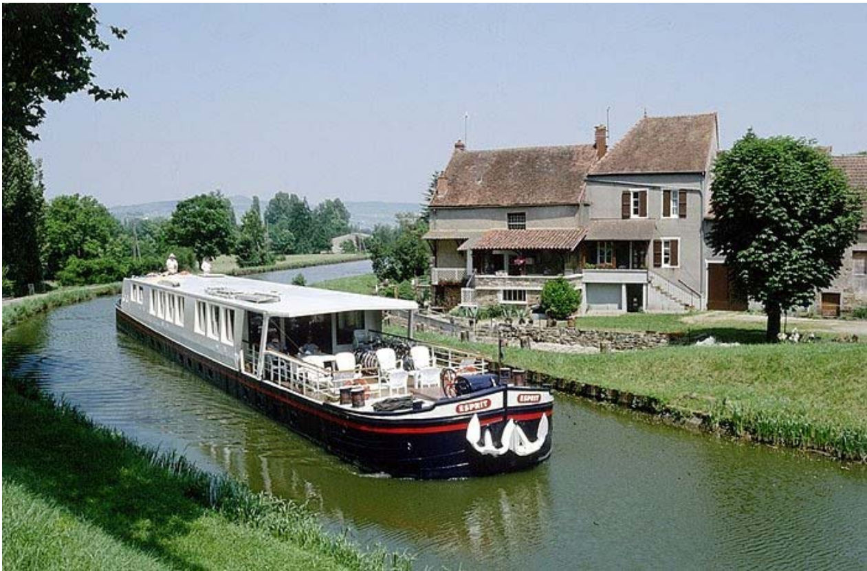
A French Country Waterways Barge

After 35 years of cruising, you can rest assured that French Country Waterways knows what they're doing. From floating by serene pastures to exploring medieval villages, these cruises are a truly unique adventure.