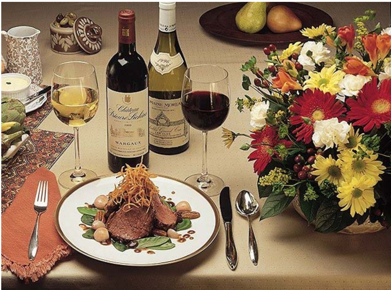
Cuisine on board French Country Waterways